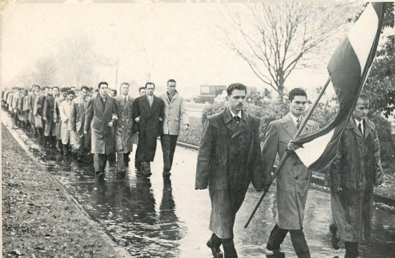
A solemn campus march on October 23, 1957, the first anniversary of the Hungarian Revolution.